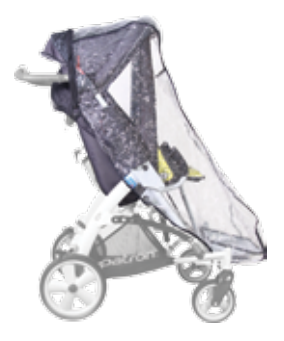
Canopy COMFORT with rain cover