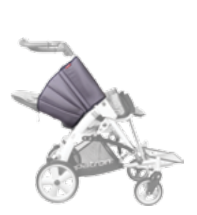
Padded frame cover with side protection