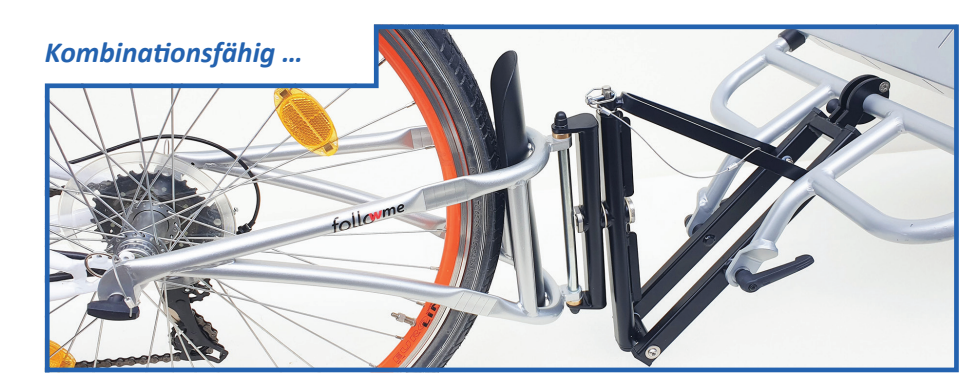
With jogger set and bicycle connection