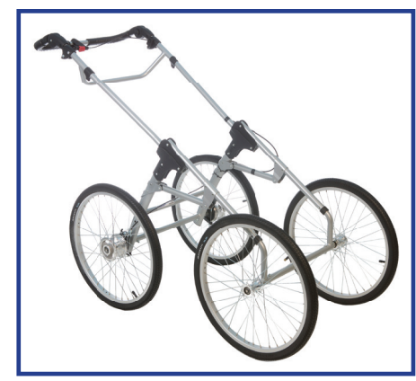
Size 2 (as above but 5 cm higher)