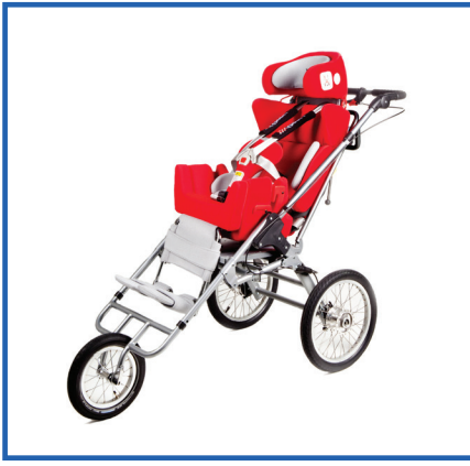
With car seat Carrot 3, footrest and jogger set