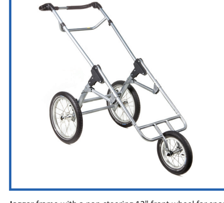
Jogger frame with a non-steering 12" front wheel for sporty purposes such as skating or jogging. With a bicycle connection it becomes a bicycle trailer (see accessories)