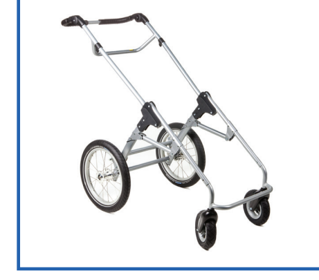
Buggy frame with two 16" rear wheels, two 10" swivel front wheels for use indoors or on flat ground.