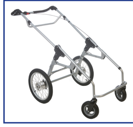
Size 3 (as above but 5 cm wider)