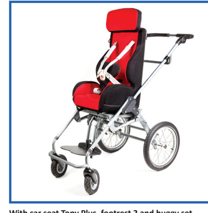
With car seat Tony Plus, footrest 2 and buggy set