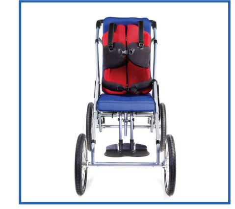
Also with corset