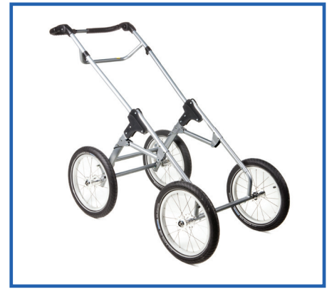
Offroader frame with four non-steering 16" wheels for forest and field and sand and beach