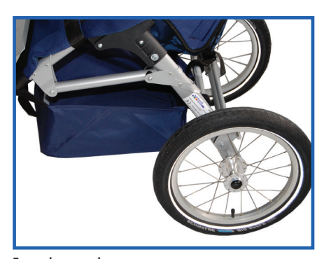
Example: cargo bag