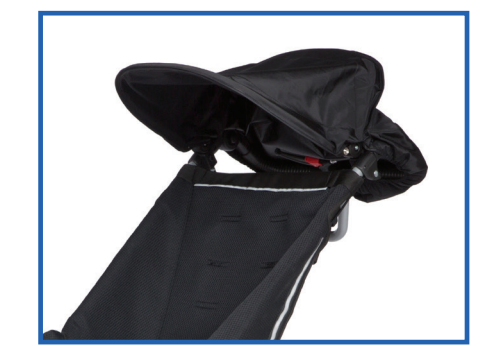
Example: sun/rain canopy