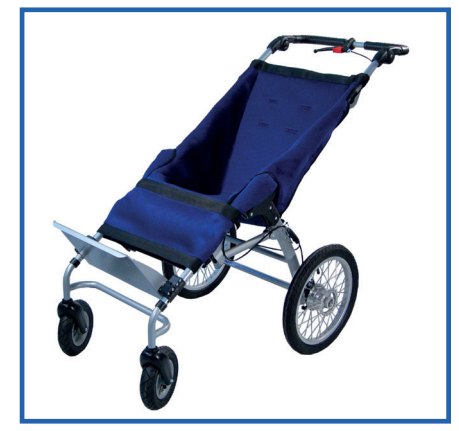
With sling seat, footrest 1 and buggy set