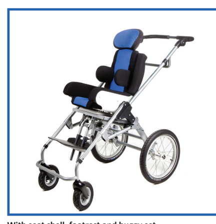
With seat shell, footrest and buggy set