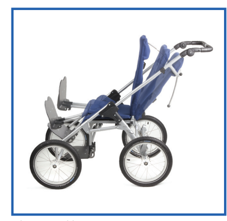
... in many positions