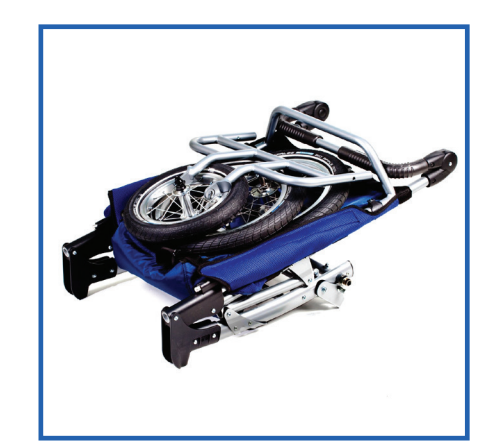
And folded the entire Multiroller is very small